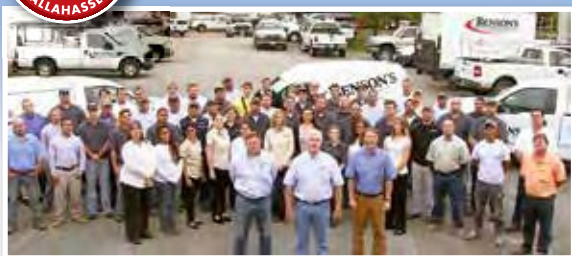
The Benson Team Loves Serving You and Our Community

Benson's is Best for Your Home and our servant attitude proves we're Best for Our Community . . .